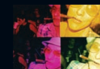
pAn VJ Singer Songwriter New Brunswick